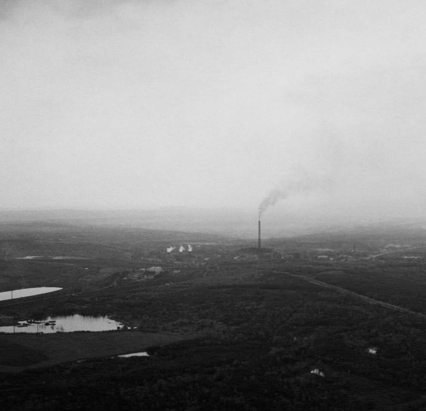
Emmet Gowin: Cooling Towers and Power Station, Bohemia, Czech Republic, 1992