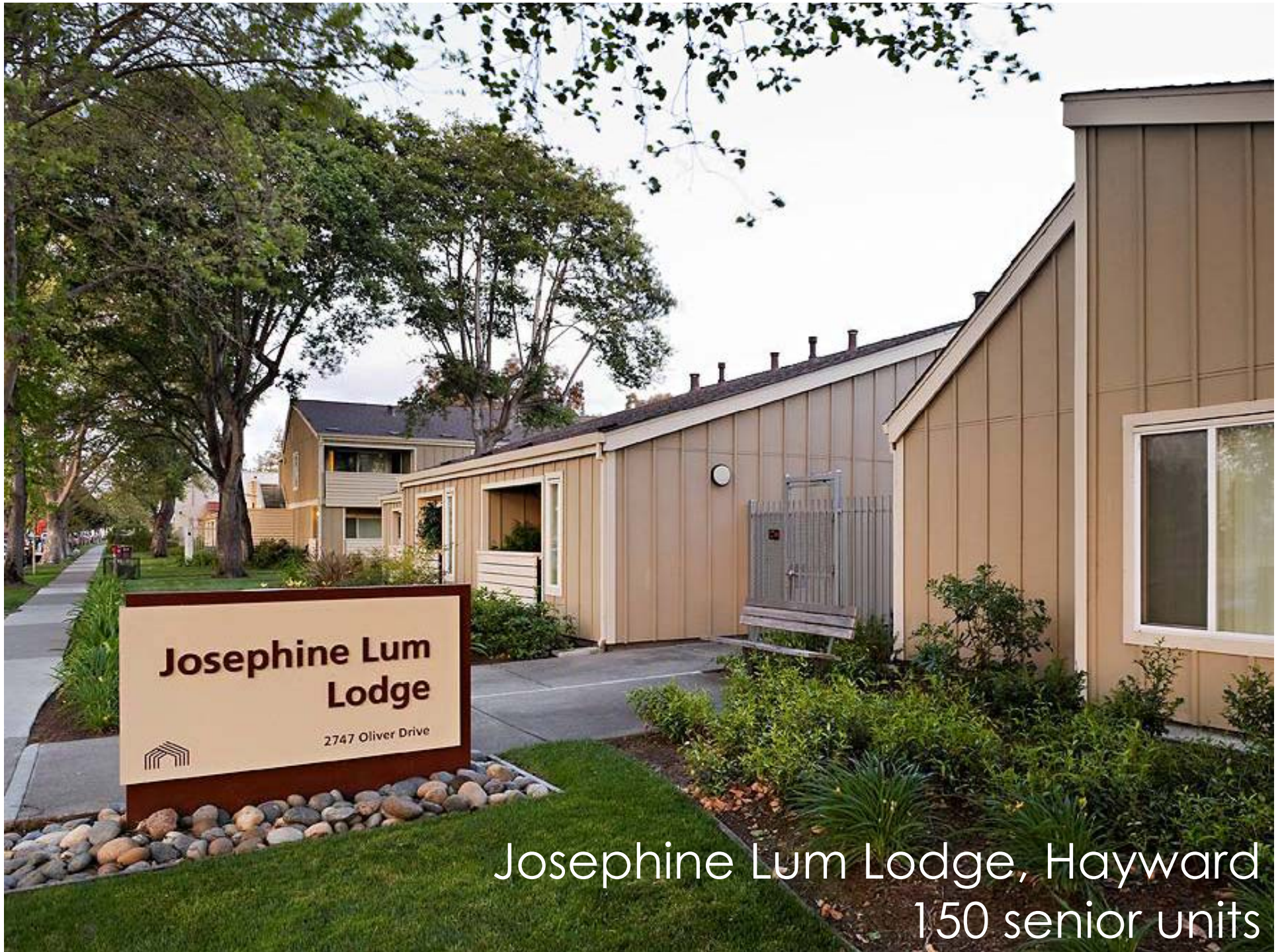
Josephine Lum Lodge, Hayward 150 senior units